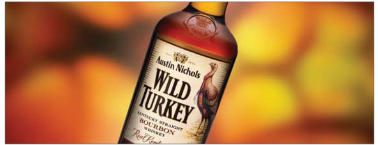
Gruppo Campari, Wild Turkey